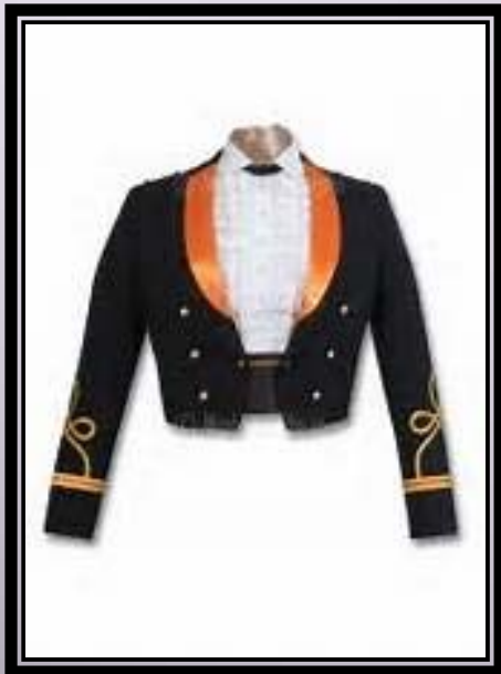
Female Blue Mess with Long Blue Skirt

Officers wear either ASU A with bowtie or Blue Mess (Retired Officers are welcome to wear their uniform)