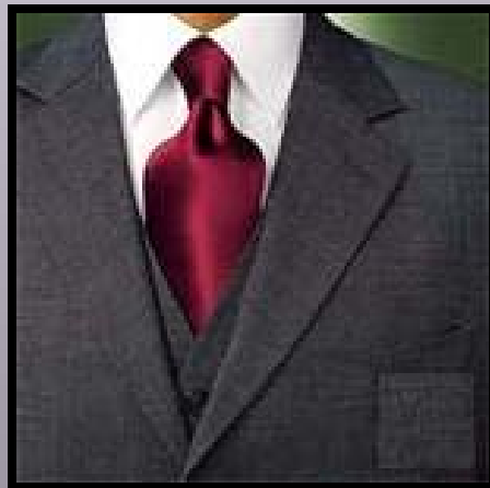
USMA formal events: Tuxedo or Suit