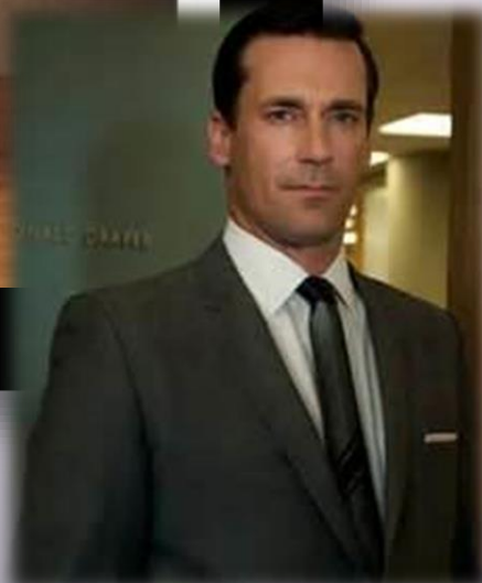
USMA semi-formal events: Suit